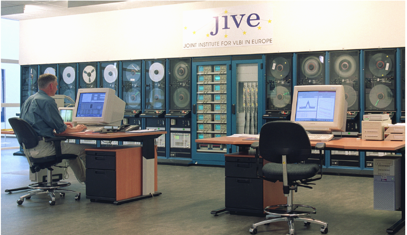
Fig. 1. The EVN MkIV Data Processor at JIVE

port of the Network. In the future the throughput will go up; speed-up correlation, in which the tapes play faster than they were recorded, was tested successfully in June 2002.