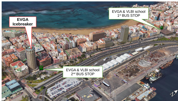
EVGA 2019 icebreaker and organised bus transfer meeting points