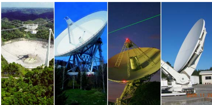
The recent additions of Arecibo (Puerto Rico), Effelsberg (Germany), Hartebeesthoek (South Africa) and TIGO (Chile) telescopes to e-VLBI capabilities of the European VLBI Network means a tremendous improvement in sensitivity for detecting the faintest cosmological sources.

Telescopes in Chile, Germany, Italy, the Netherlands, Puerto Rico, South Africa and Sweden simultaneously observed quasar 3C454.3 and additional targets and streamed data to the Joint Institute for VLBI in Europe (JIVE). There the data was correlated in real-time, and results were transmitted to Bruges, Belgium, as part of a live demonstration at the TERENA Networking Conference 2008.